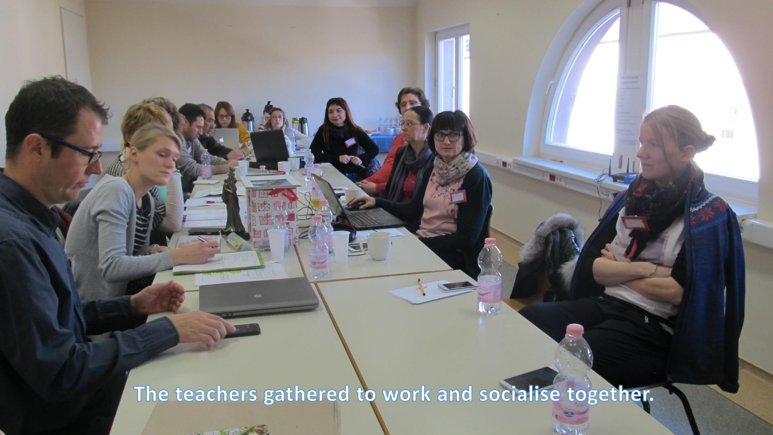
The teachers gathered to work and socialise together.